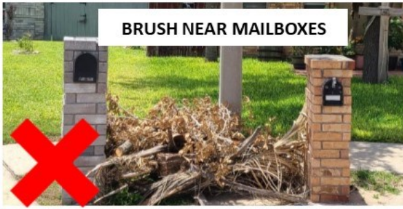
BRUSH NEAR MAILBOXES

PLEASE FOLLOW THESE SIMPLE TIPS TO HELP US FACILITE AND EXPEDITE YOUR BRUSH PICK UP POR FAVOR SIGA ESTOS SENCILLOS CONSEJOS PARA AYUDARNOS ACELERAR EL PROCESO DE RECOGER SUS RAMAS