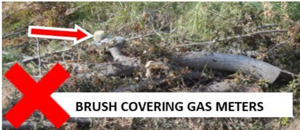
BRUSH COVERING GAS METERS