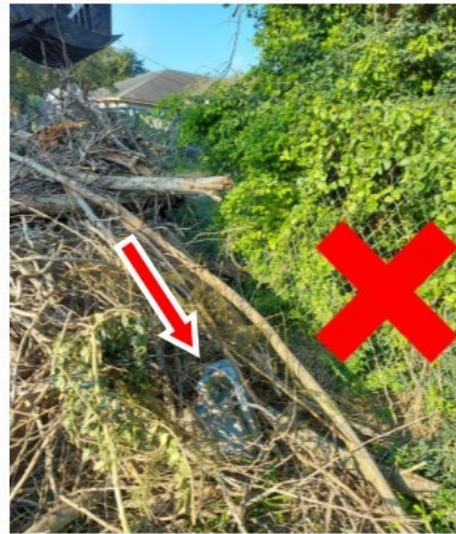
BRUSH COVERING WATER METERS