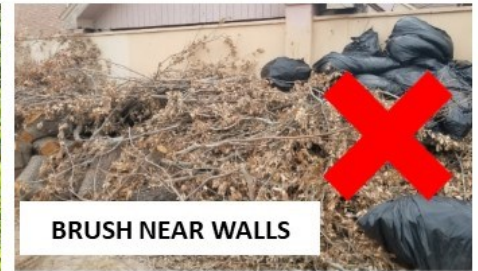
BRUSH NEAR WALLS