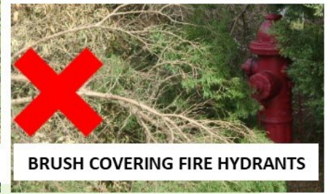
BRUSH COVERING FIRE HYDRANTS